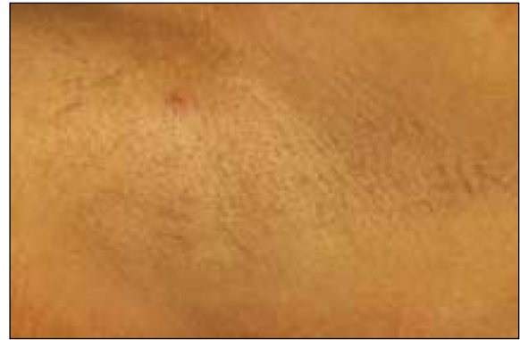
39 year old Skin Ethnic Color Type V patient, Axilla, 100 ms, 30 J/cm 2 , 3 treatments (1 month apart). Baseline and 6 months after last treatment.