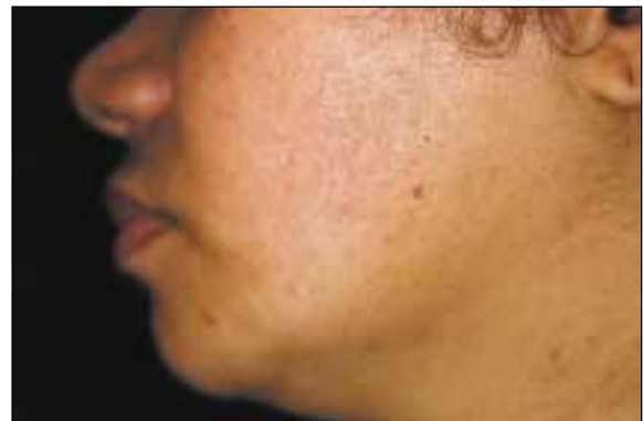
35 year old Skin Ethnic Color Type V patient, Face, 100 ms, 30 J/cm 2 , 3 treatments (1 month apart). Baseline and 3 months after last treatment. Notice that the hairy nevus has also been removed.