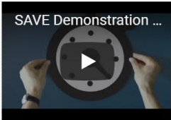
SAVE Demo Video